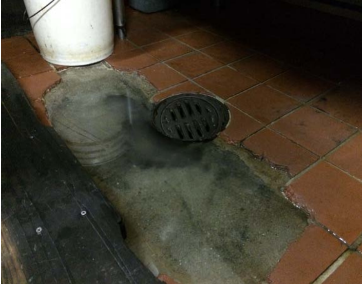
Subfloor and joist heavily damaged