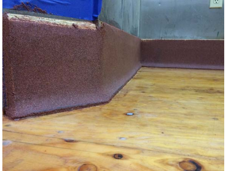
Body coat with aggregate to ensure mechanical bonding of subsequent layer. Trowel install 1/4" cementitious urethane mixture