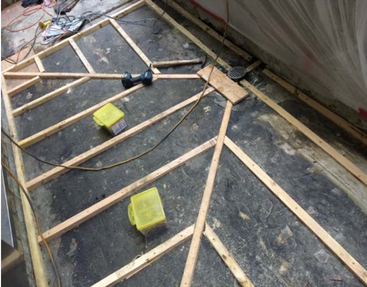
All cleaned, repaired, now making new slope to drains