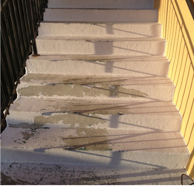
Front stairs before