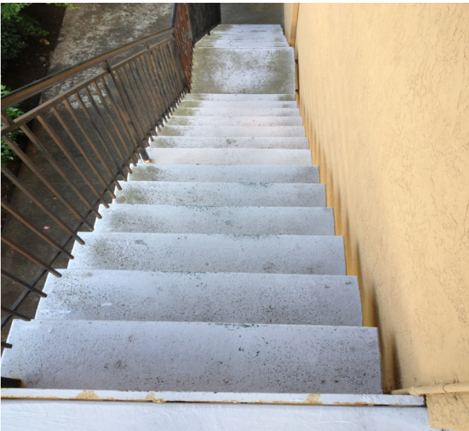
Back stairs before