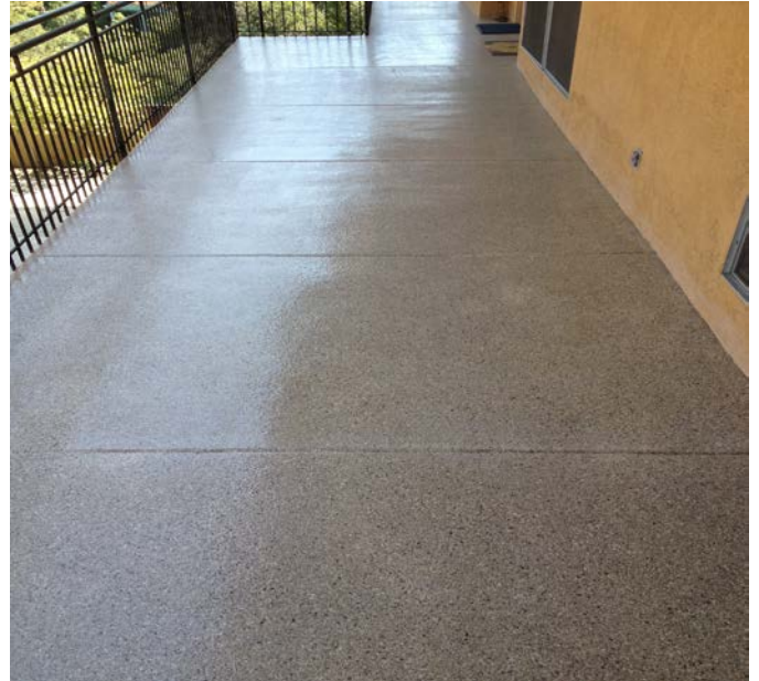
Done with very light non-skid texture