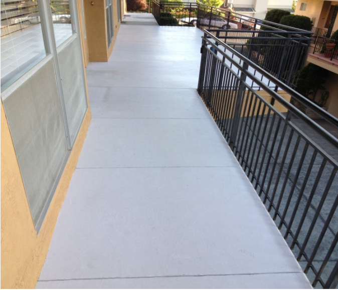
Current concrete with paint (failing & chipping)